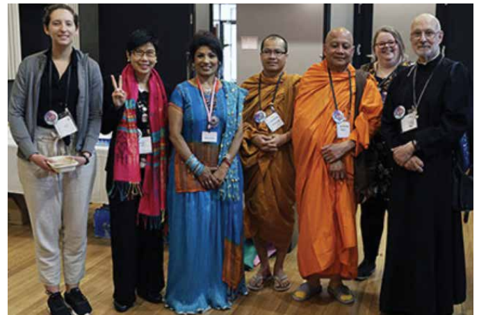
Attendants from various multicultural and multifaith backgrounds