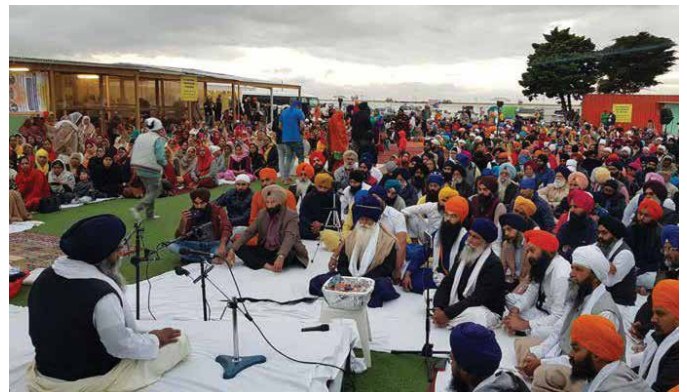
Dal Baba Bidhi Chand Ji Khalsa Shaouni, Plumpton