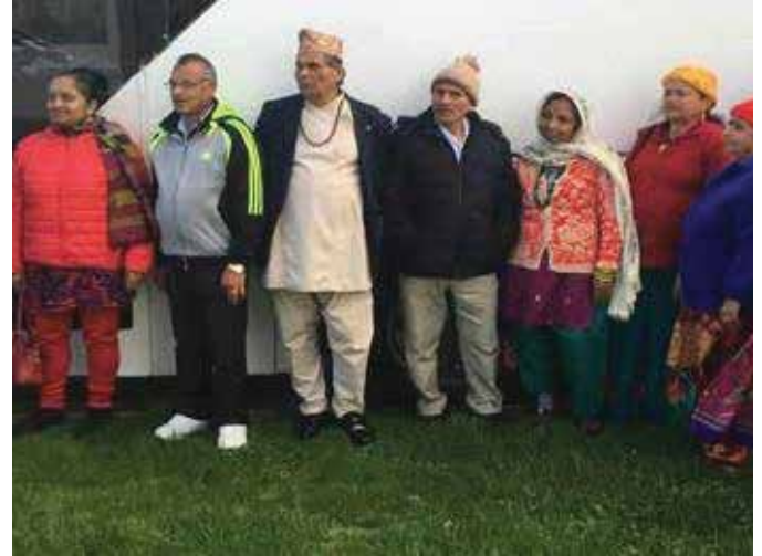
Sri Guru Singh Sabha, Craigieburn