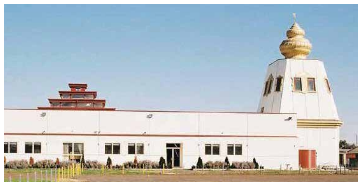
Sri Durga Temple, Deanside