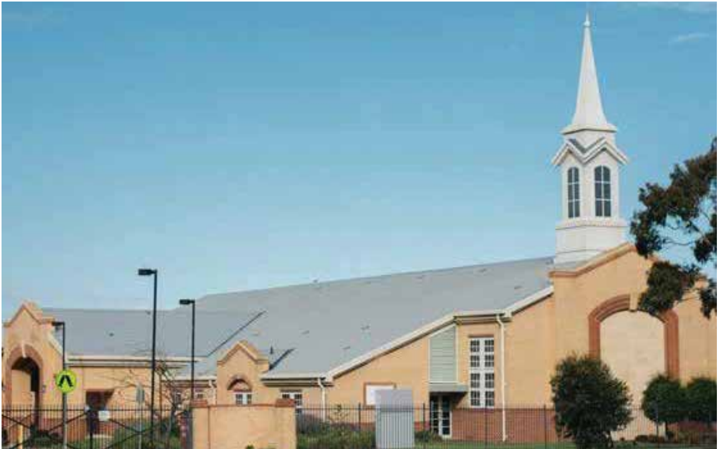
The Church of Jesus Christ of Latter-day Saints, Melton

599 High St, Melton West VIC 3337, Australia