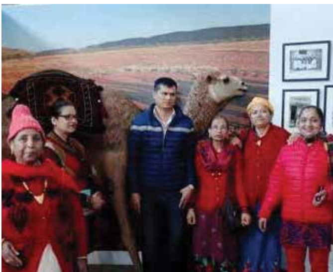
Islamic Museum, Thornbury