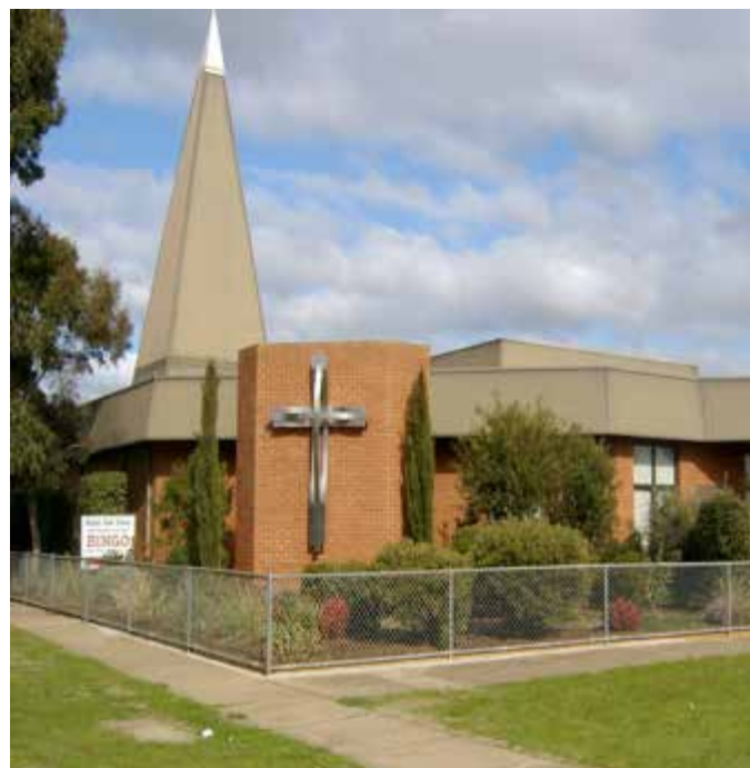
St. Anthony of Padua Parish, Melton South