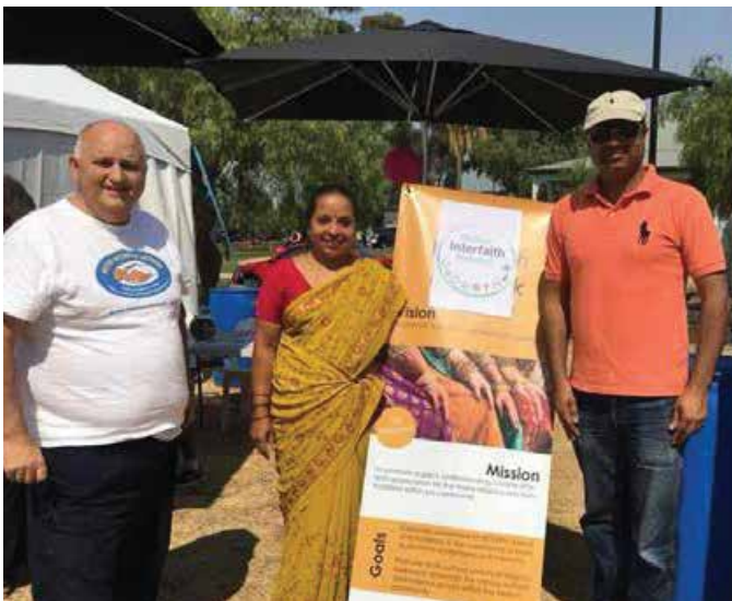
Taylor's Hill Harmony Day