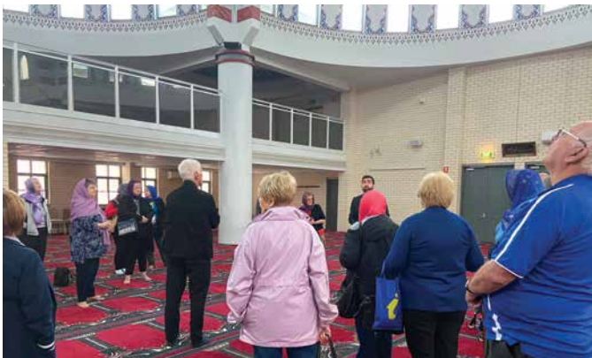
Sunshine Mosque, Sunshine