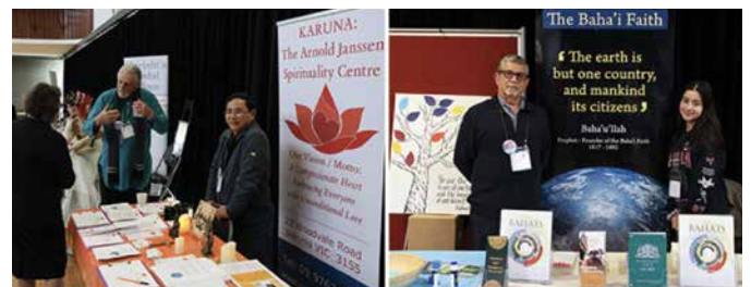
Faith Stands: Karuna Spirituality Centre (left) and Baha'i Community (right)