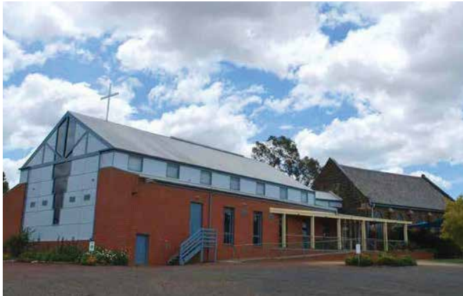
Melton Uniting Church, Melton

The Melton Uniting Church has been part of the Melton community for more than 100 years in Melton and Melton South, within a historical Bluestone Chapel a part of the Melton complex. It was formerly the Methodist, Presbyterian and Congregational churches. Major celebrations include Christmas, Easter and Pentecost, as well as annual recognition of the church's presence in the community. The church is host to various other Christian communities for their celebrations including a significant Sudanese fellowship.