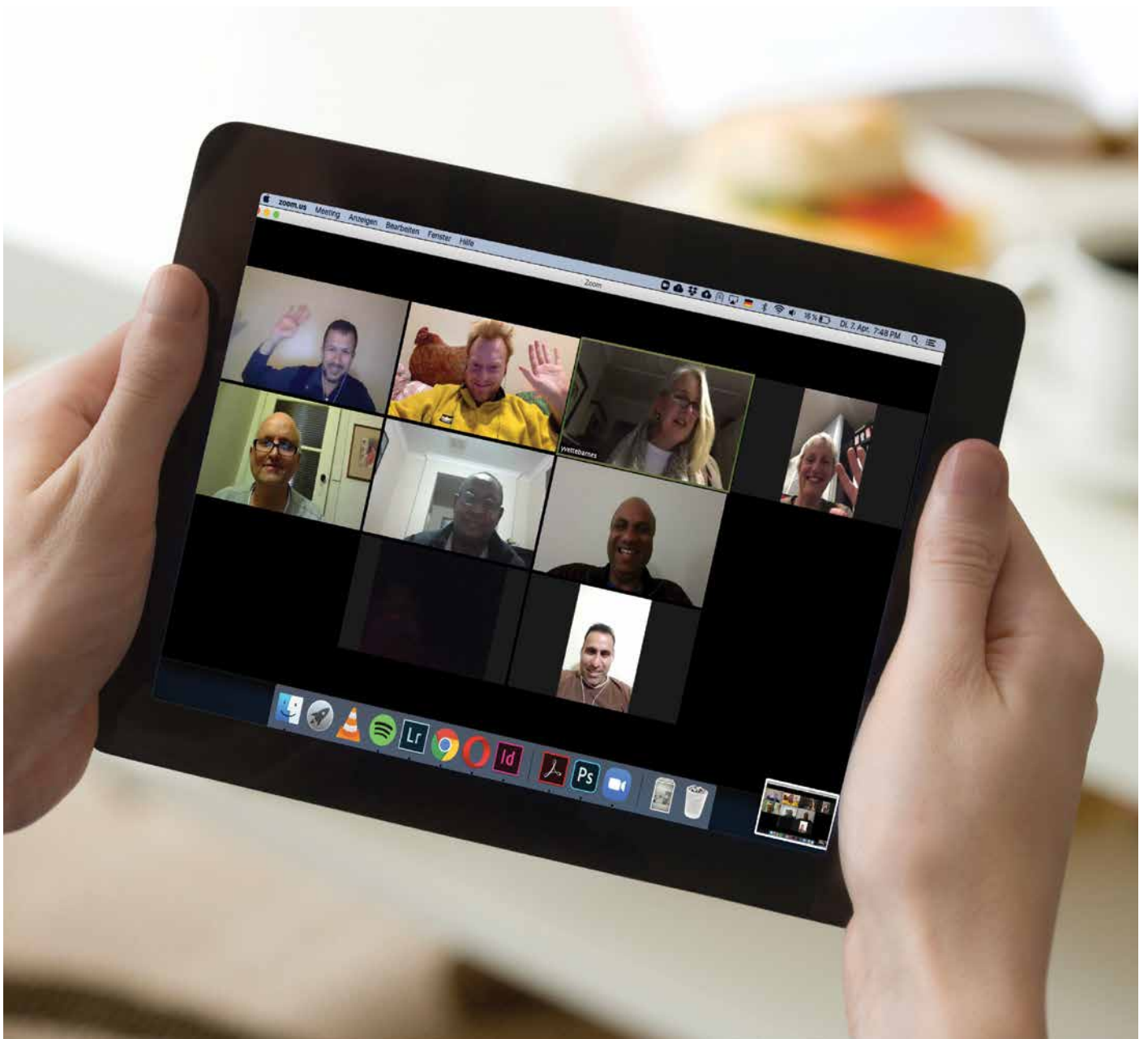
MIN meetings even on Zoom

You can expect someone to open with prayer and give Acknowledgement of Country. Committee members are all volunteers from various local religions. There will be an employee from Melton City Council at each meeting.