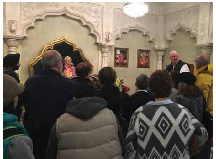
ISKCON Hare Krishna Temple, Albert Park