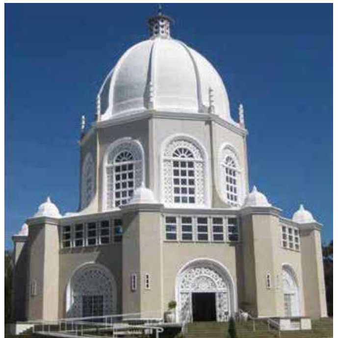
National Baha'i Centre, NSW