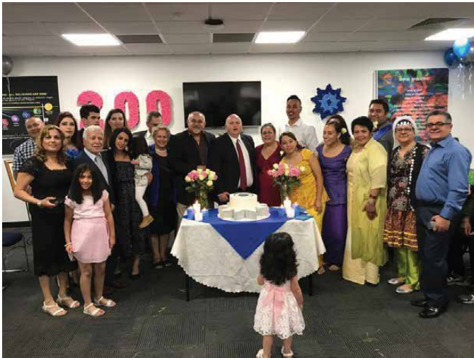
Birth of Bahá'u'lláh