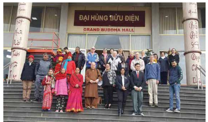
Buddhist Temple, Braybrook