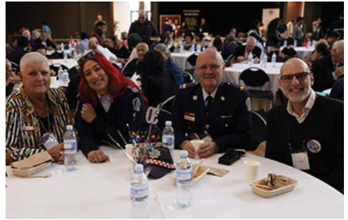
Participants at Interfaith Conference

The Victorian Interfaith Networks Conference (VINC) is an annual grass-roots conference which aims to help build the capacity and sustainability of existing interfaith networks, bring people up-to-date with current interfaith matters and provide networking opportunities. The conferences are events that include a keynote speaker, several workshops, display stands representing different faiths, entertainment and a meal.