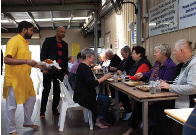
Sri Durga Temple, Deanside

about religions other than their own. Tours also provide participants with an opportunity to meet and converse with different people in a relaxed atmosphere and are an excellent interactive learning experience.