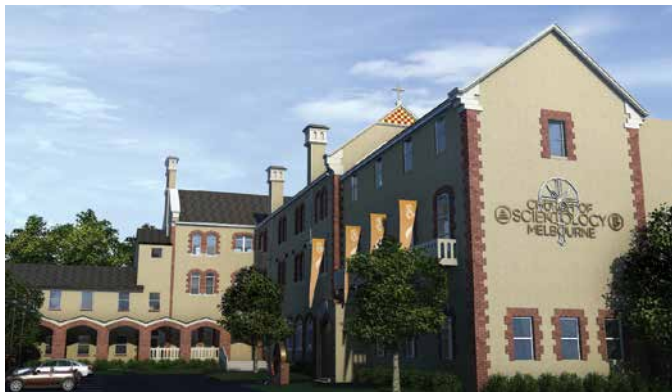
Church of Scientology, Ascot Vale