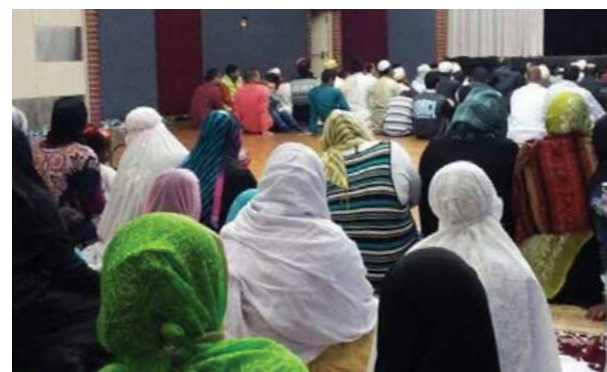
Muslim prayer meeting